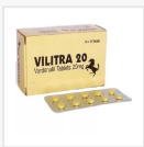
Vilitra 20 mg $22.00