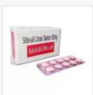
Malegra Pro 100 mg $21.00