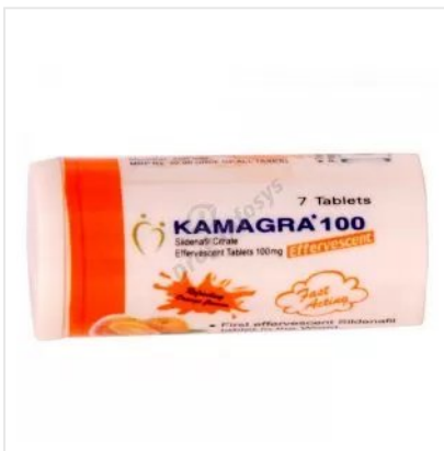
Kamagra Effervescent 100 mg