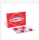
Avana 100 mg $50.00