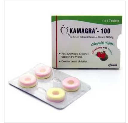
Kamagra Chewable Tablets 100mg