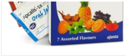
Apcalis SX Oral Jelly 20mg