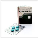
Kamagra 100mg $22.00