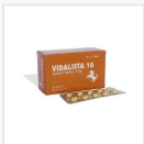
Vidalista 10 mg $25.00