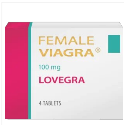
Lovegra 100 mg