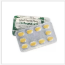
Tadagra 20 mg $20.00