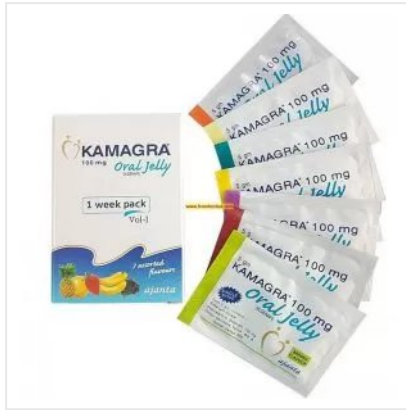
Kamagra Oral Jelly 100mg