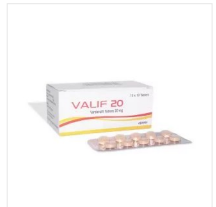
Valif 20 mg